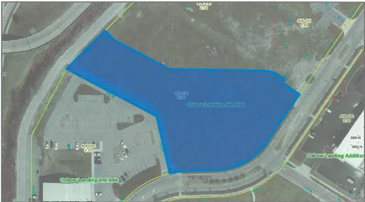
MAP 1: Oxbow Landing ERA #2 Boundary

Note: All parcels above will be combined as and under parcel number 45-07-16-404-015.000-023 by the Office of the Lake County, Indiana Auditor, Department of Tax Mapping.