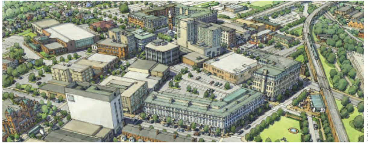
Downtown Hammond looking south along Hohman Avenue with Rimbach Square in the foreground.