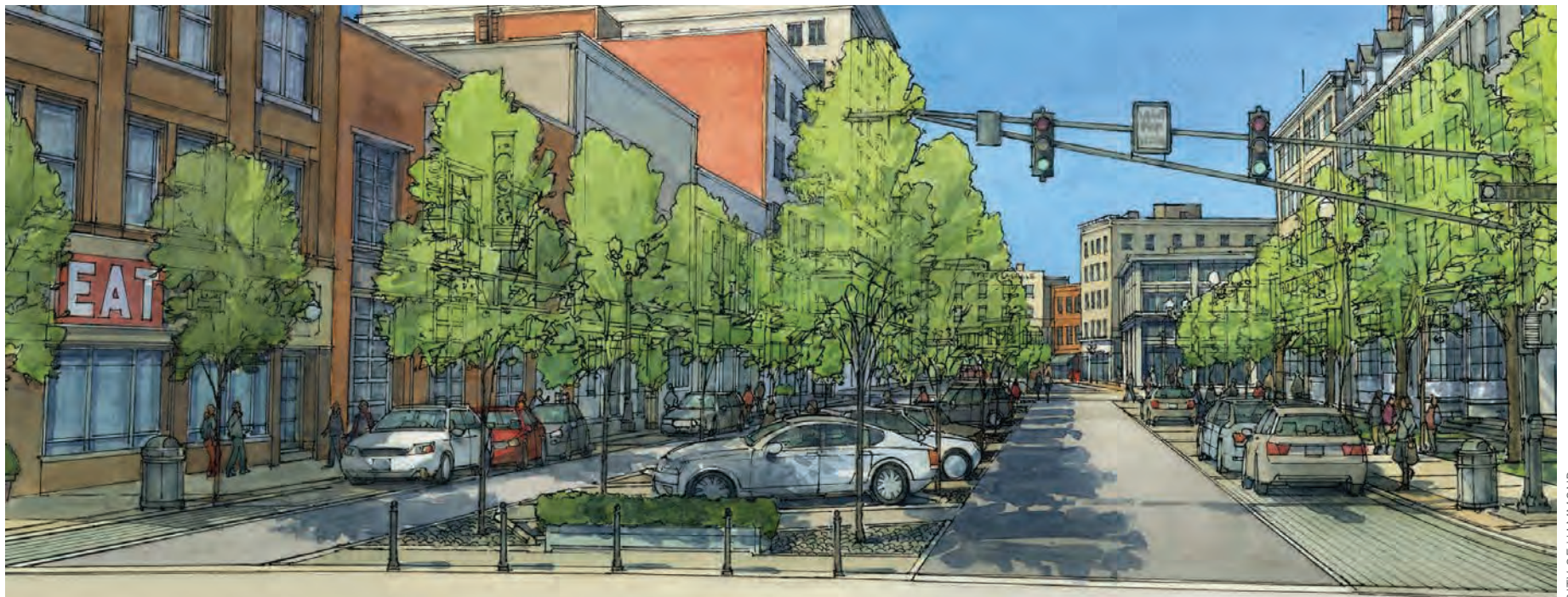
CITY OF HAMMOND

The city has a choice: continue revitalization as it has been doing or embrace the changes outlined in this report by creating the organizational structure to manage the city's revitalization efforts and establishing the Downtown Hammond Development Fund. This approach entails greater risk but has a potential of higher rewards and fulfillment and most importantly will implement the Downtown Master Plan.