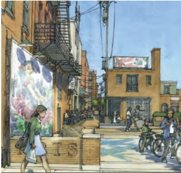
CITY OF HAMMOND

Arts Alley is a creative and interesting reuse of existing space and provides a link between downtown and the train station.