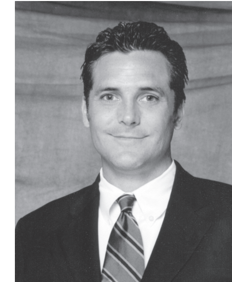
Mayor Thomas McDermott, Jr.

In 1995, the Hammond Water Works changed over to granular activated carbon rather than anthracite as a filter media to control taste and odor. We have continued using this filter media and are investing over Four million dollars on various improvements to our Lake Michigan based Filtration Plant. Hammond residents continue to enjoy the lowest water rates in the State of Indiana.